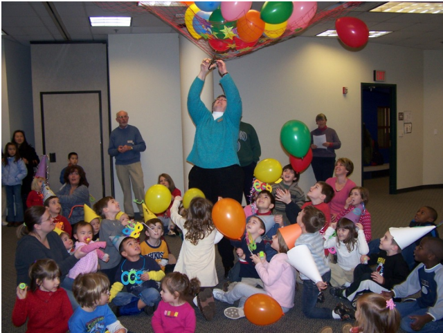
Countdown to New Years' (at noon) in the Children's Room.