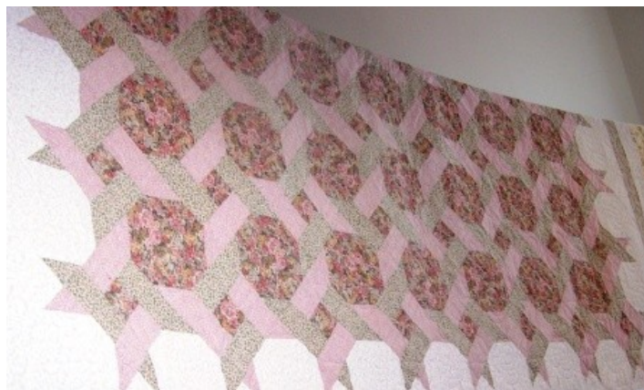
This month's quilt is by Rita Kenny. It is on display over the front circulation desk and can be viewed during library hours.