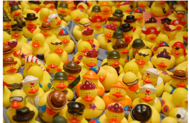
Rubber Duckies are getting ready to race!

their choice. All the duckies will be displayed in our large display window in the children's room until the ducky race at our party. Even if you don't complete your reading record, you can still come to the party. Rain date will be at 10:00 a.m. on August 14. Registration is required. Please stop by the Children's desk or call the library at 330-688-3295.