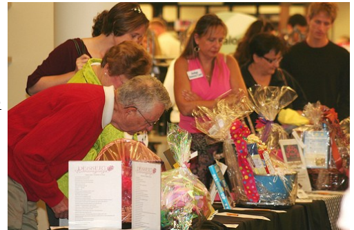
Guests look over the wonderful auction items.

For more information, please visit www.smfpl.org/dessert