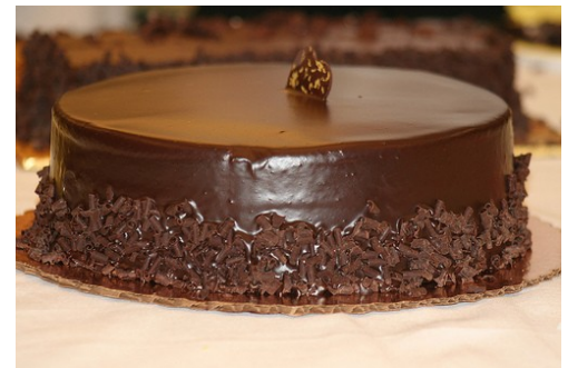
Just one of the many fabulous desserts!