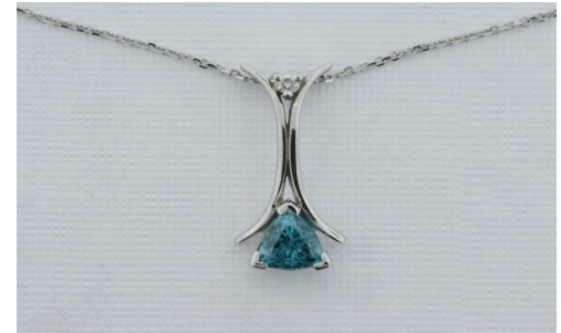
Abshire & Haylan has donated this blue zircon and diamond 14 ct. white gold pendant on a 14 ct. white gold cable chain valued at $815 dollars. It will be raffled off during the event.