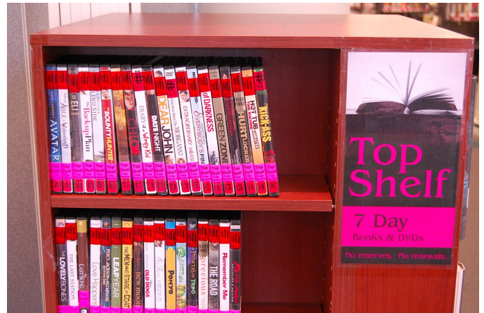
Check out our new "Top Shelf" display in the front of the library.

reserves and can not be renewed. They also only get checked out for 7 days. It's our goal to have more new and popular material right at the check out so you can grab it right when you come in. We hope you like this new service!