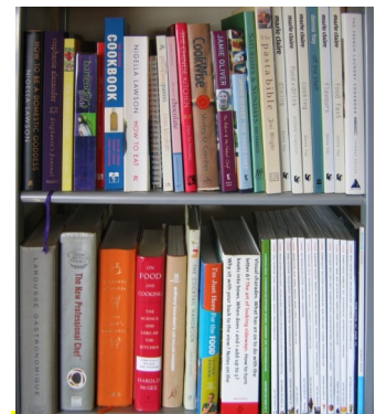
Book Sale and Book Donation Day!

Munroe Falls Public Library. Book Donation Day is Saturday, Sept. 11 from 10:00 to 4:00. Please bring used books, DVDs, puzzles and more to the back door of the library. Donations are tax deductible and receipts are available upon request. Donate 10 items on this day and receive a pass to the Friends' Presale on September 29 from 10:00 to 1:00.