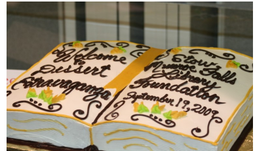
A fantastic cake from last year's event by Judy's Sweet Sensations.

Abshire & Haylan donated our featured auction item of the night, a diamond and blue zircon pendant.. (This is their 5th year in a row!) Tickets for Dessert Extravaganza are on sale now at the front desk of the library for $25. For more information please visit www.smfpl.org .