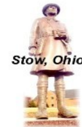
Statue of the Doughboy in front of Stow City Hall.