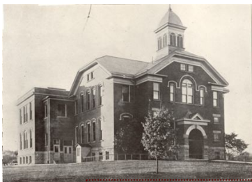
Stow High School Circa 1915