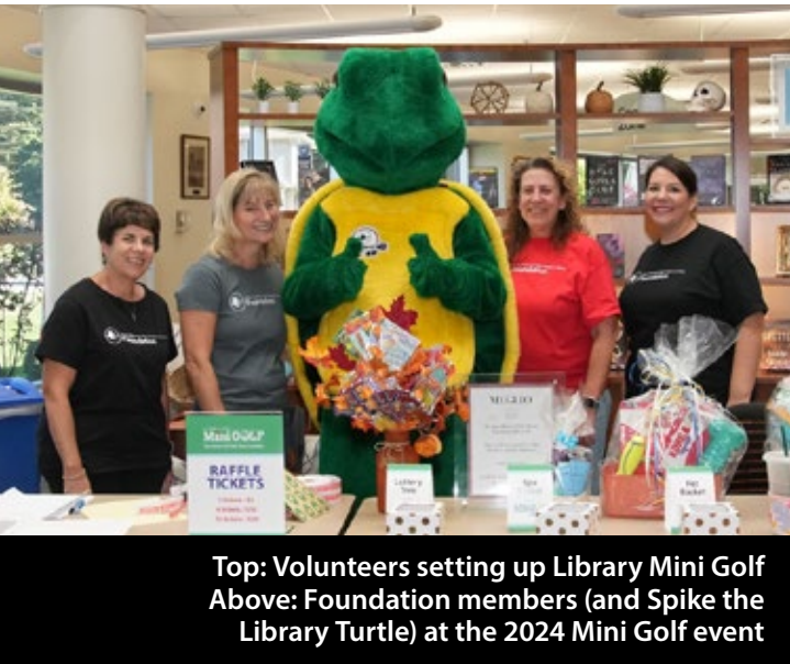
Top: Volunteers setting up Library Mini Golf Above: Foundation members (and Spike the Library Turtle) at the 2024 Mini Golf event