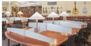
Connect Zone table