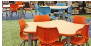
Children's Room furniture