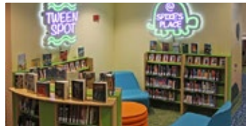
Signs and shelving for the Tween Spot