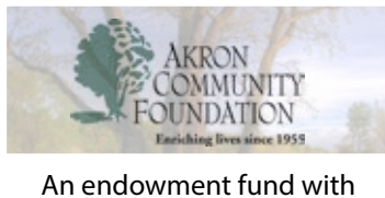
An endowment fund with the Akron Community Foundation