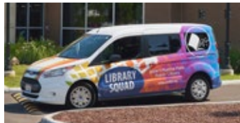
Library vehicle (in conjunction with the library)