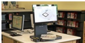
Self-checkout machine in the Children's Department